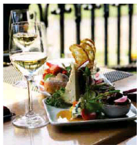
LEFT: COVERT FARMS'S SWEET RIDE, SEEN THROUGH ROWS OF VINES; ABOVE: LUNCH ON THE PATIO AT BURROWING OWL ESTATE WINERY